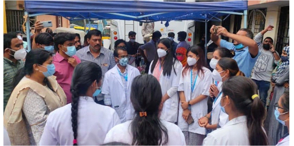
Flagging of BBMP's programme of Door-to-Door visit to screen people for Covid-19 at Gurappanapalya ward