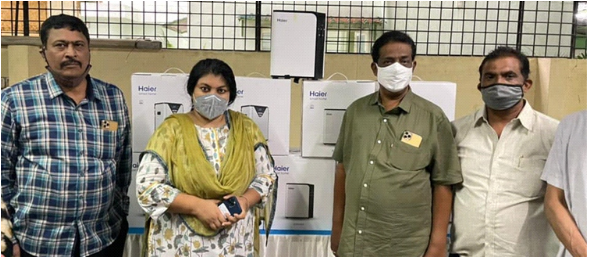
Launching of "MLA COVID CARE" oxygen concentrators procured from my personal savings and with the help of funds contributed by many donors to help the Covid positive patients