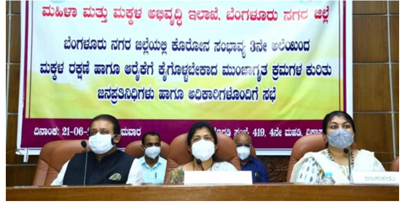
Attended the meeting along with Women and Child Development Minister and other officials to discuss on "Child protection and preventive measures on Covid 3rd wave"