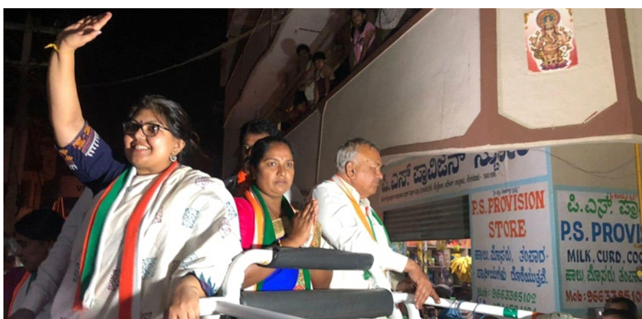
Held campaign and sought votes for the candidates contesting from our Congress party on account of Chandapura Purasabhe and Hebbagodi Nagarasabhe elections.