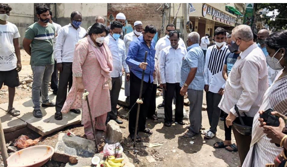
Performing pooja to mark the commencement of concrete pavement work in Gurappanpalya ward