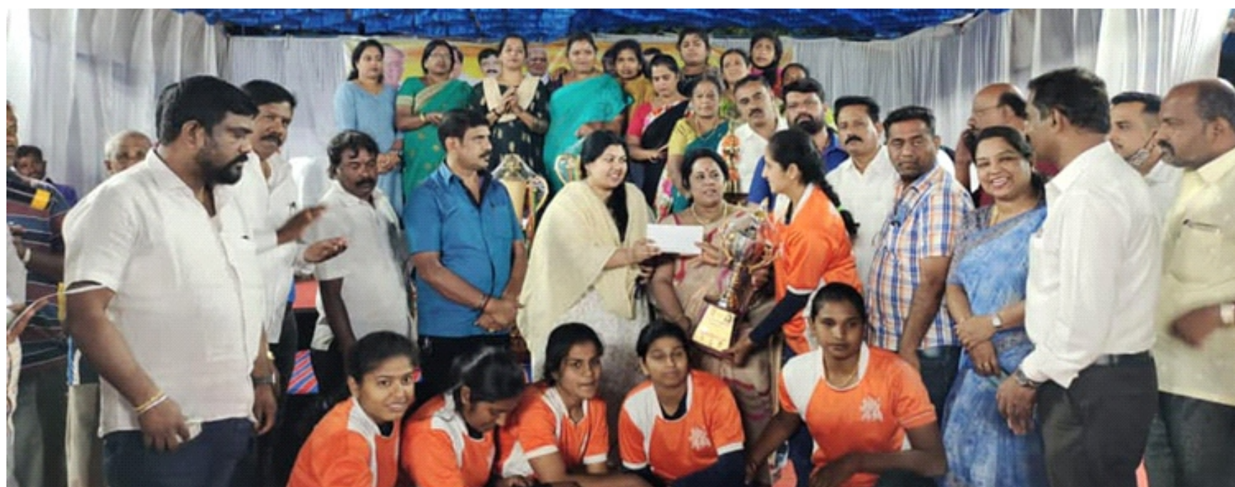
Distributing prizes to the Men & Women teams who won the RLR Kabaddi tournament at Sudduguntepalya