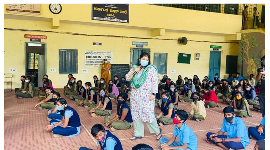
On the occasion of Advocates Day organized Oath taking ceremony & quiz competition on Indian constitution for the students at Karnataka Public School