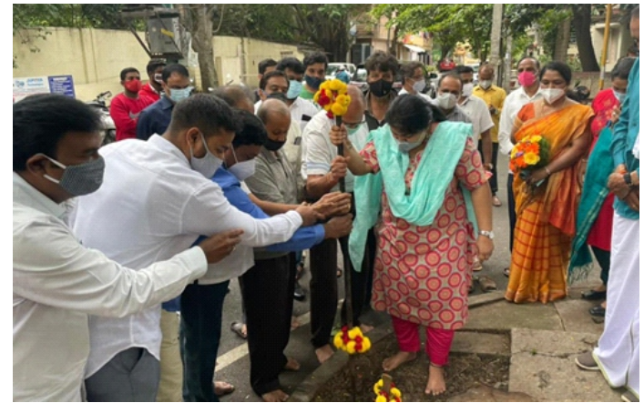
Performing pooja to mark the commencement of the developmental works in Shakambari Nagar ward