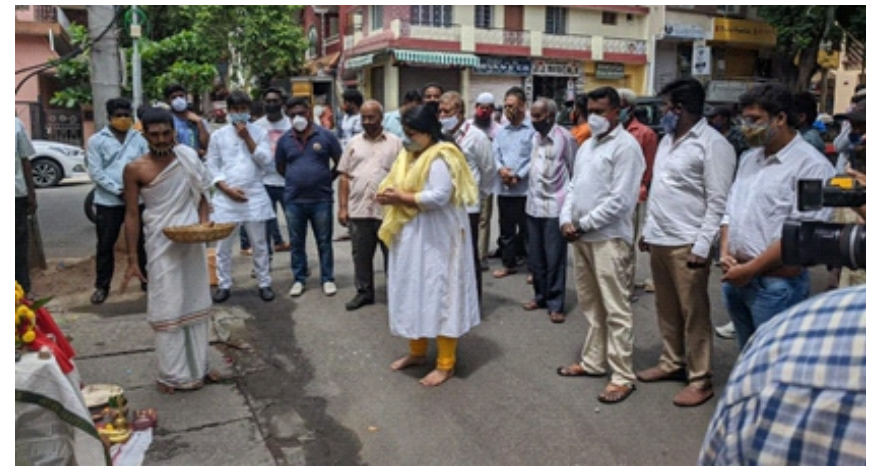
Commencement of the improvements of roadside drains & footpath development works in Jayanagar East ward