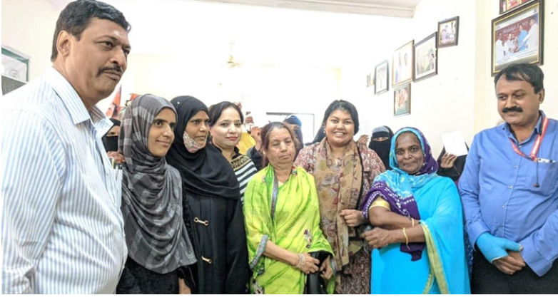
Distribution of the Micro & Shramashakti loans to the beneficiaries at Gurappanapalya ward