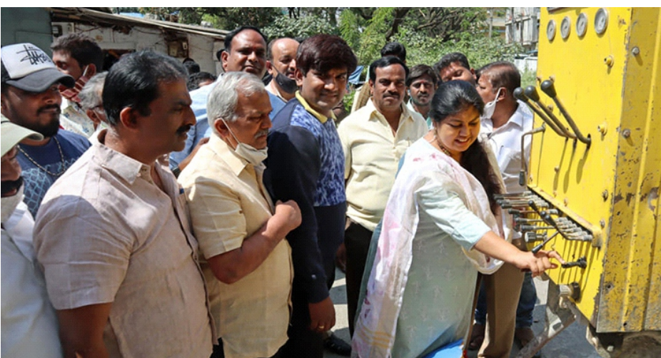
Performing pooja to mark the commencement of the new borewell installation work in Sarakki ward