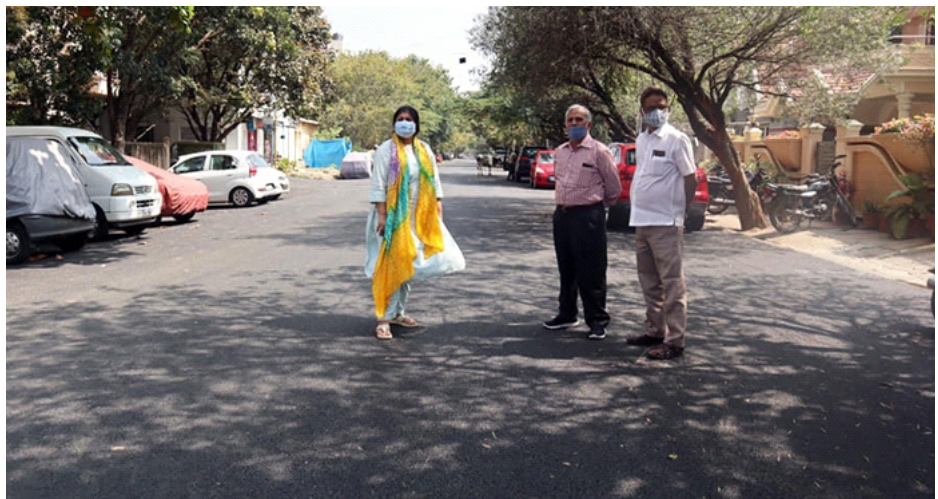
Inspection of the road asphaltting and drain development works at JP Nagar