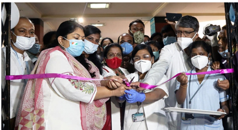
Launching of the Covid- 19 vaccination center as part of nation wide vaccination drive at Jayanagara General Hospital