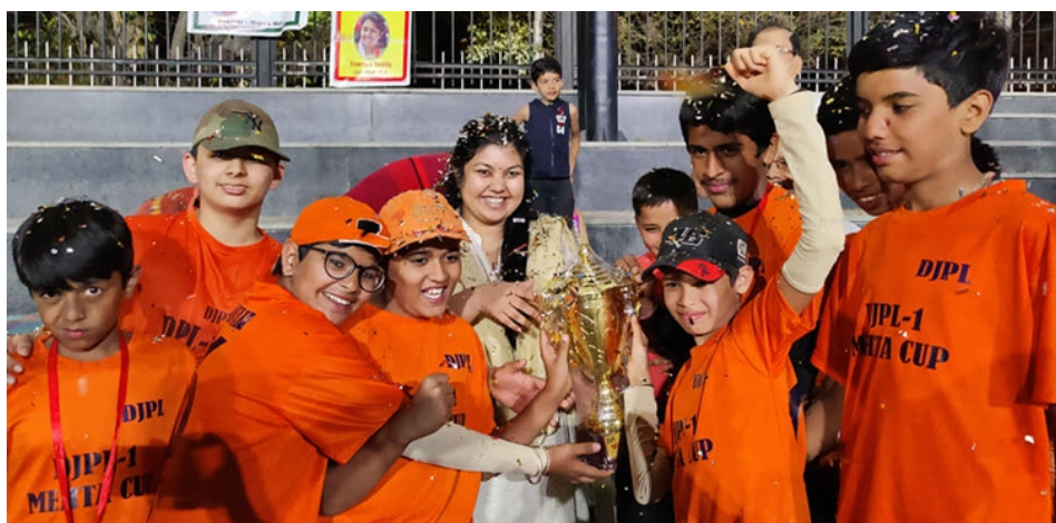
Attended the DGPL 1 (Mehta Cup) cricket tournament as Chief Guest at MES Ground, Jayanagara