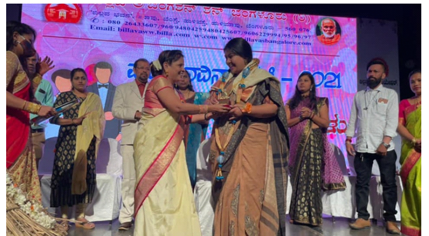
Participated in the Women's Day Celebration' program organised by Billava Association at Devaki Anand Suvarna Convention Hall