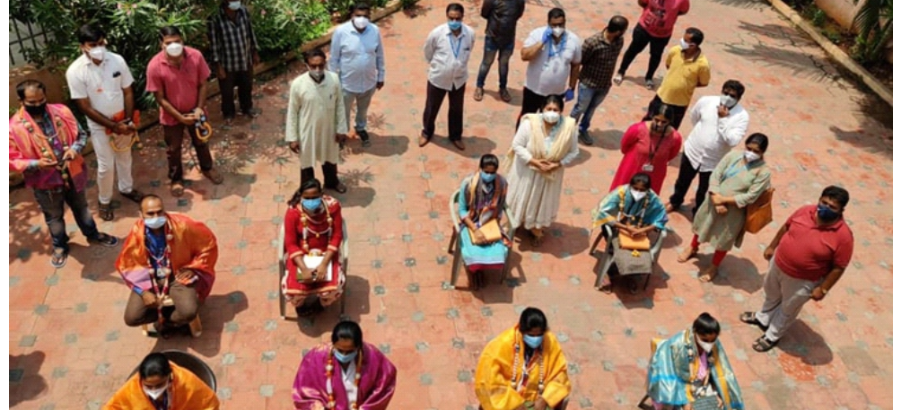
Felicitations to nurses by distributing Ilkal sarees on the occasion of Nurse Day at Shakambari Nagar ward