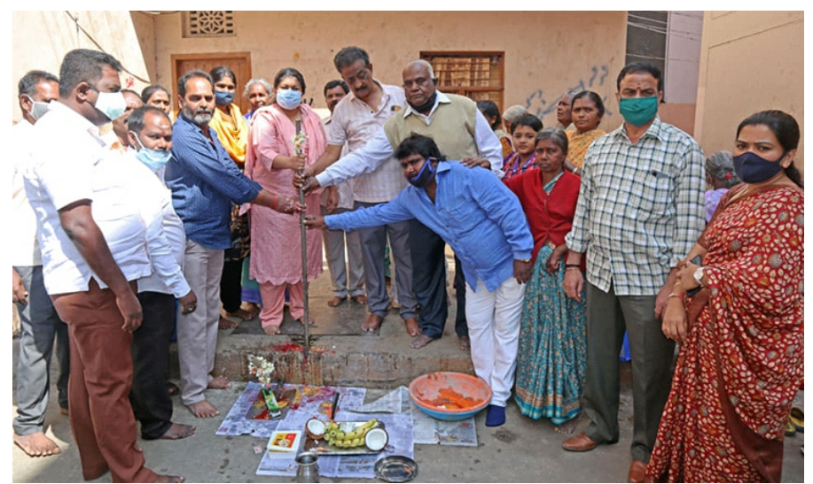
Performing pooja to mark the commencement of emergency UGD and repairs works in Byrasandra ward