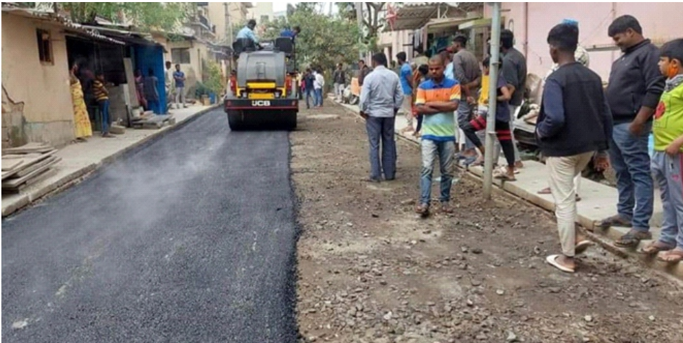
Performing pooja for the commencement of asphaltting works in Jayanagara East ward.