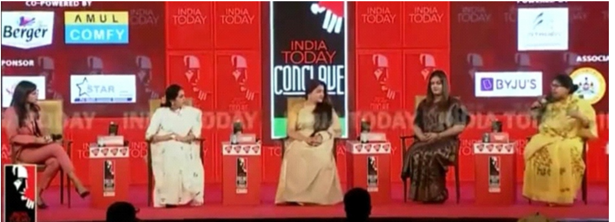
Speaking at the India Today's South Conclave program on 'Women in Power: Breaking barriers, Making a Mark'