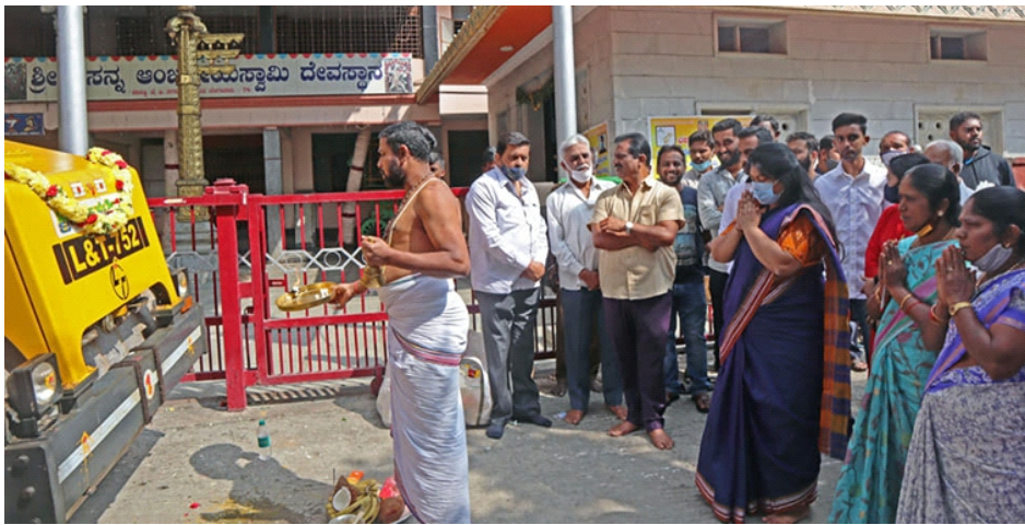
Performing pooja to mark the commencement of road asphaltting works in Sarakki ward