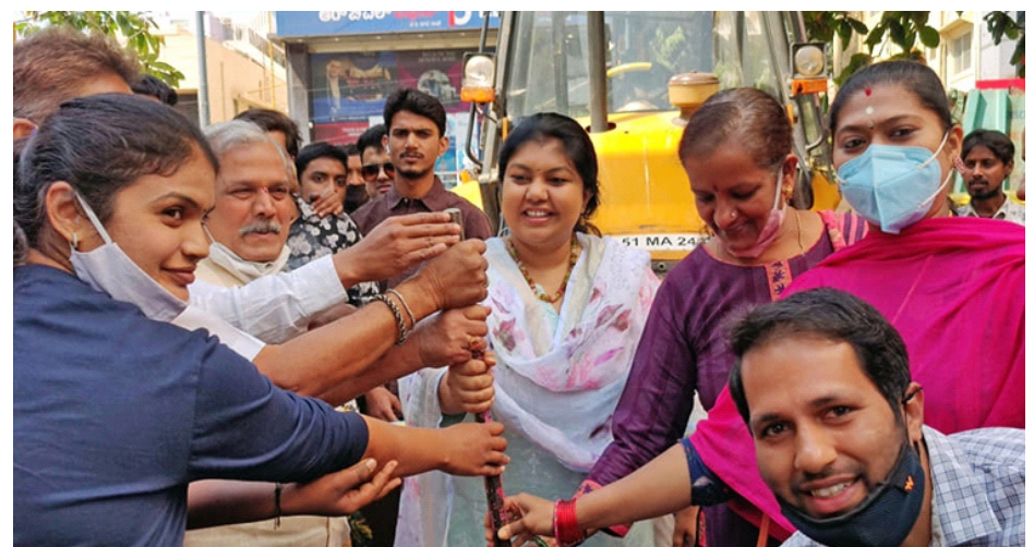
Performing pooja to mark the commencement of emergency UGD & repair works in JP Nagar ward