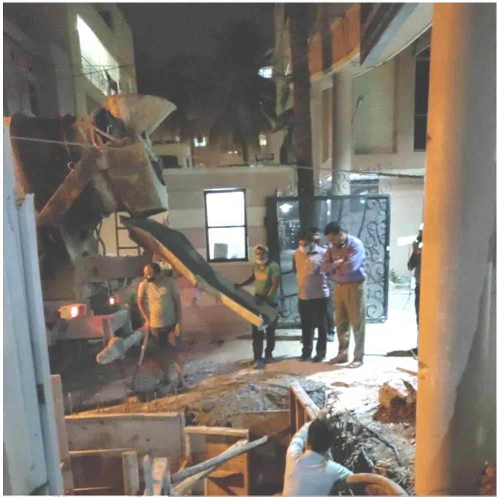
Concreting works for drains near Jayanti Garden apartment in Shakambari Nagar ward