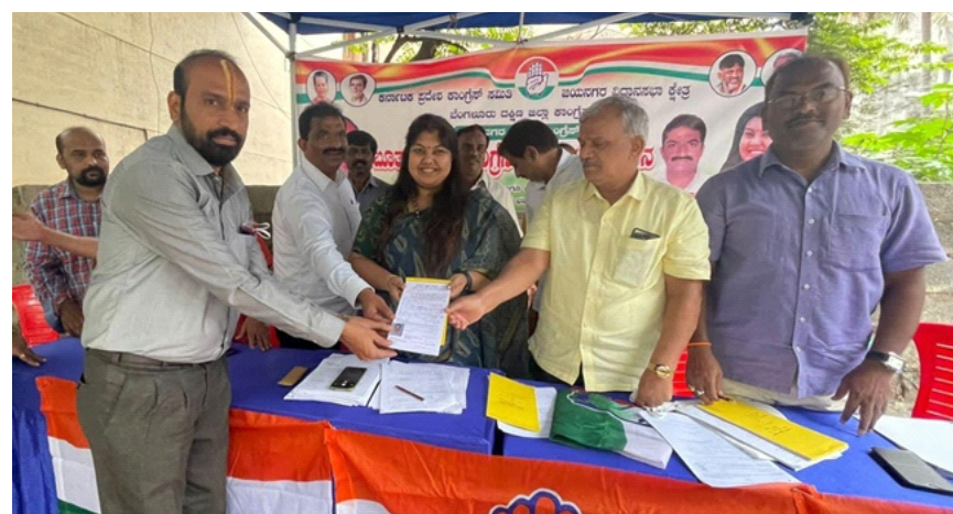
Congress membership drive was organized at various places in Jayanagara assembly constituency