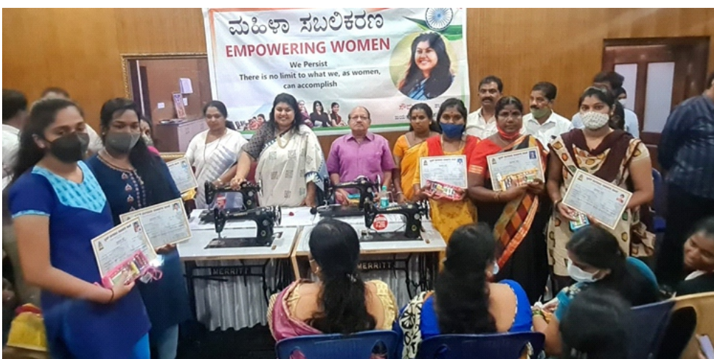
Distribution of 50 sewing machines, tailoring kit and course completion certificates provided by BBMP to the women trainees of the Byrasandra & Sarakki ward