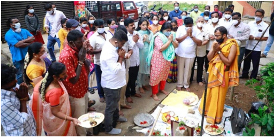
Performing pooja to mark the commencement of CC Road & drain works at Ragigudda Colony in JP Nagar ward