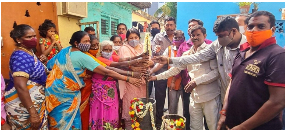
Performing pooja for the commencement of laying 230mm dia sewer line at Sudarshan Colony