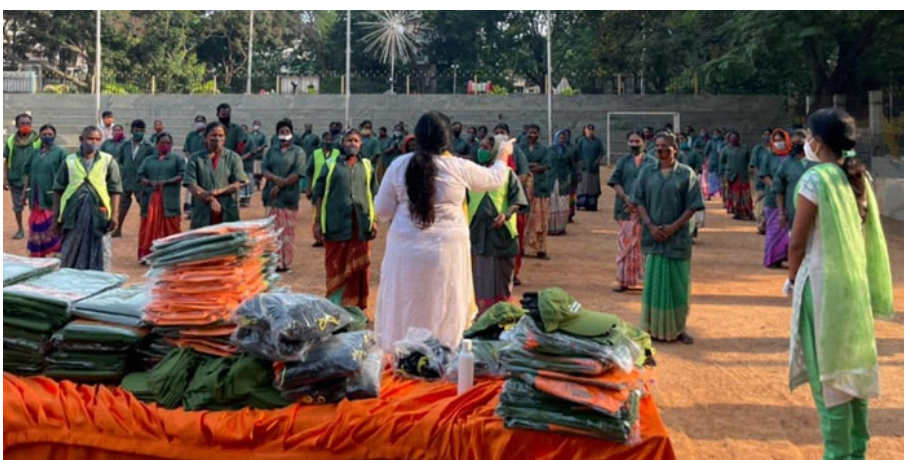
Distribution of uniforms to the Pourakarmikas of Gurappanapalya, Byrasandra and Pattabhiramanagara wards