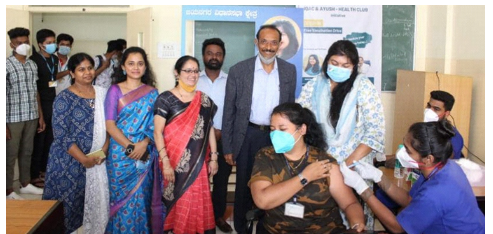
Inauguration of vaccination drive for students of 15-18 years of age at SSMRV College in 4th Block, Jayanagara