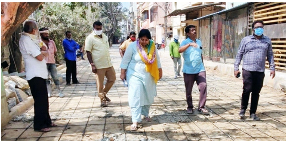
Inspection of the concrete road works at Marenahalli Tank Bund and Thayappanahalli in Pattabhirama Nagar ward