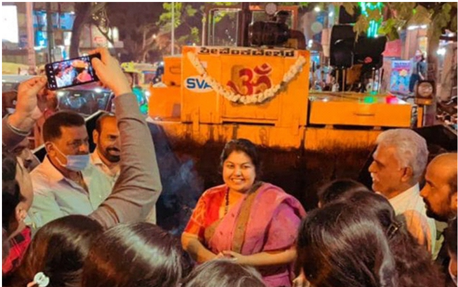
Performing pooja for the commencement of asphaltting & other developmental works in Sarakki ward