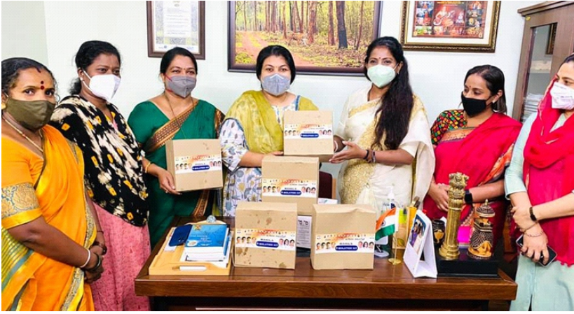
Distribution of the "Mahila Isolation kits" to women on the occasion of Sri Rajiv Gandhi's 30th death anniversary at Jayanagar MLA Office today.