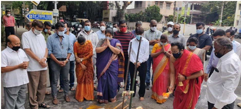
Performing pooja for the commencement of laying of 300mm dia sanitary pipeline in 4th block Jayanagara.