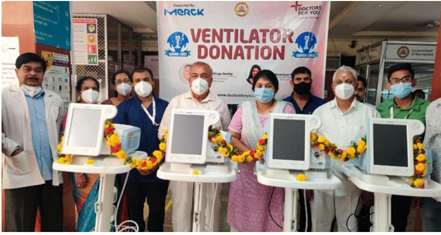
Donation of ventilators by Merck Group & Doctors for You associations for the Jayanagara General Hospital